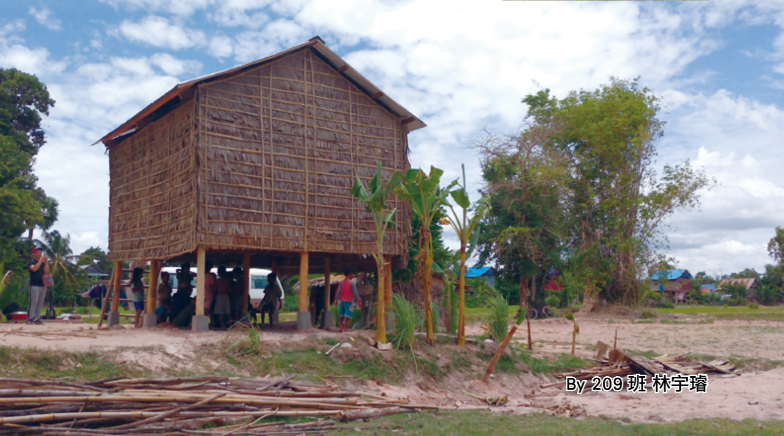
By 209班 林宇璿